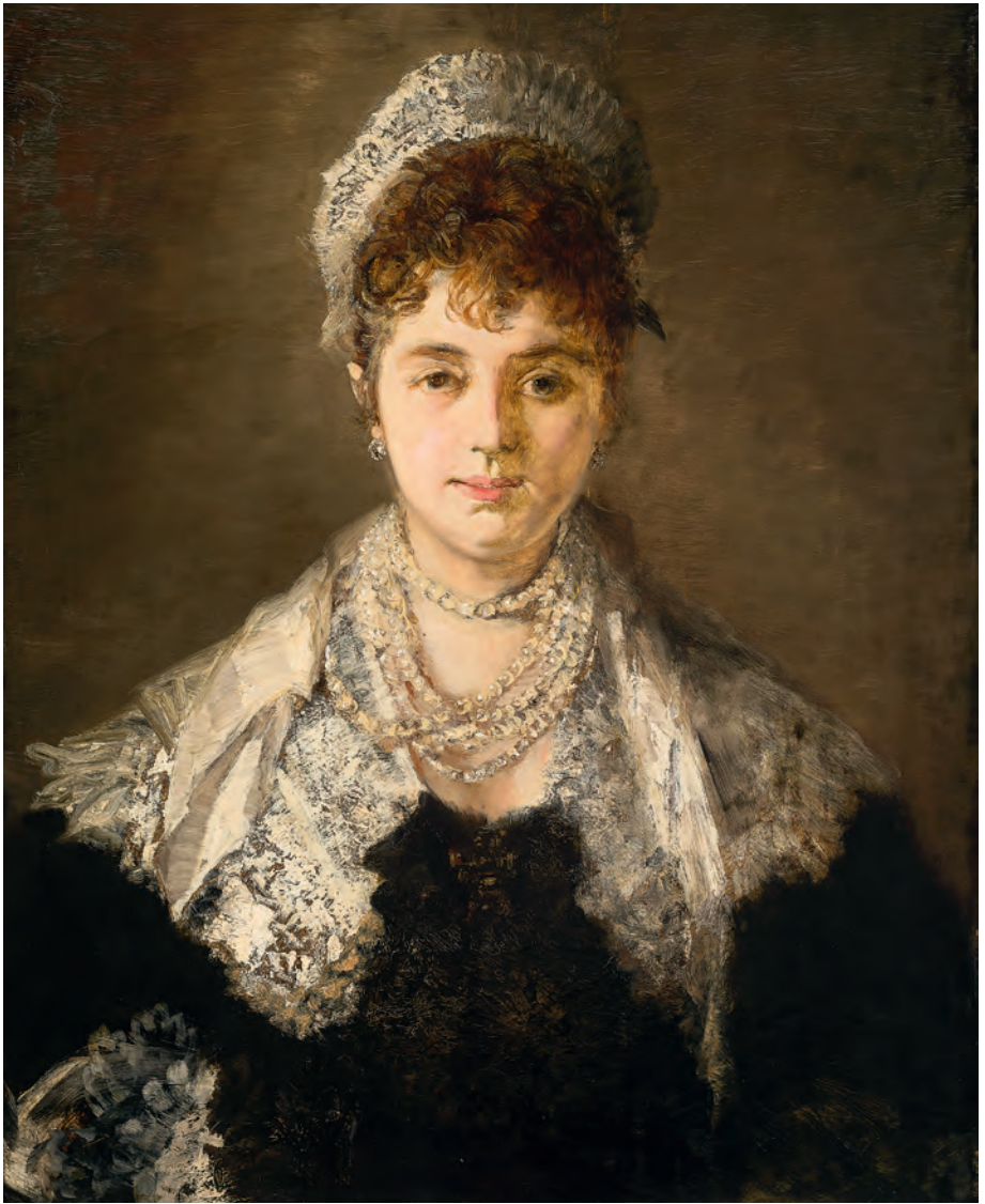
HANS MAKART, Portrait of a Lady , 1873/74