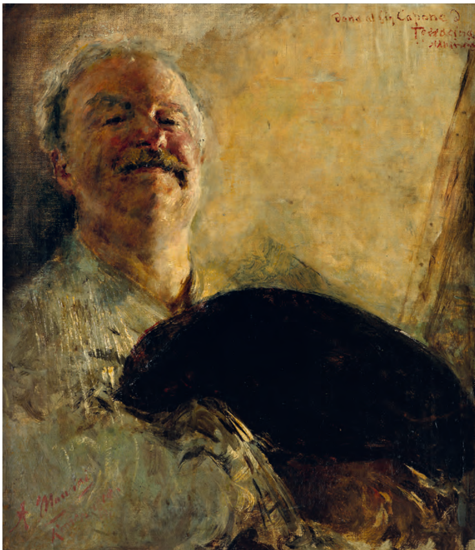
ANTONIO MANCINI, Double-sided Self Portrait , 1910